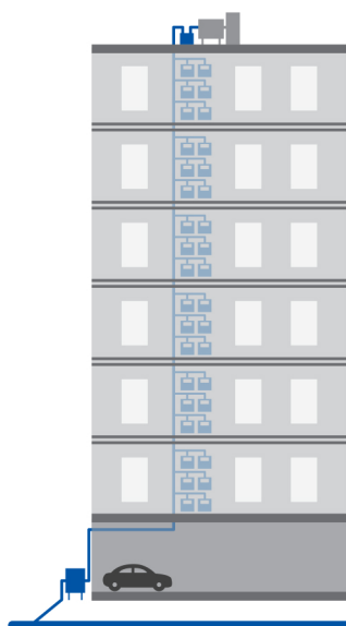
Gas infrastructure with central duct.