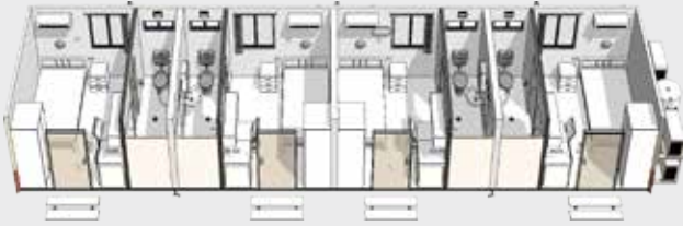
V-314A 4 person Accommodation Unit