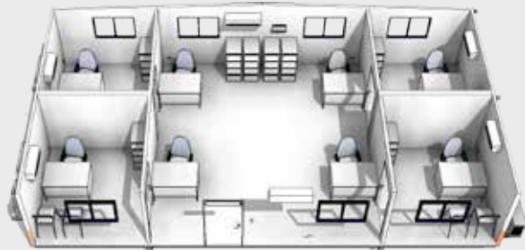
WOF-511 12.0m x 6.0m Site Office